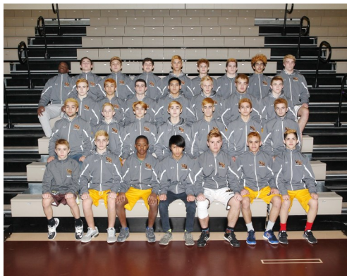
WHRHS Wrestling Team Skyland Conference Champions State Sectional Champions District 16 Champions