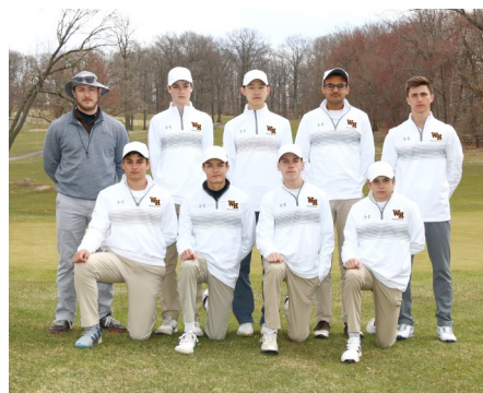
WHRHS Boys Golf Team State Sectional Champions Group IV State Champions