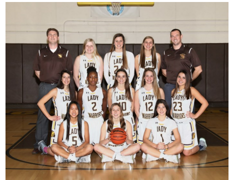
WHRHS Girls Basketball Team Skyland Conference Champions