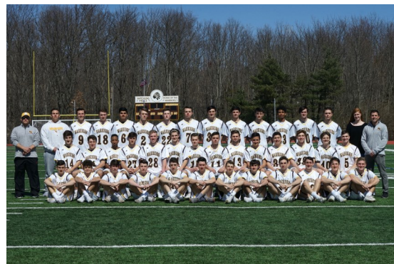
WHRHS Boys Lacrosse State Sectional Champions & State Group IV Champions