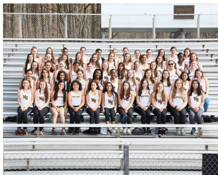
WHRHS Girls Track Team Group 4 State Champions